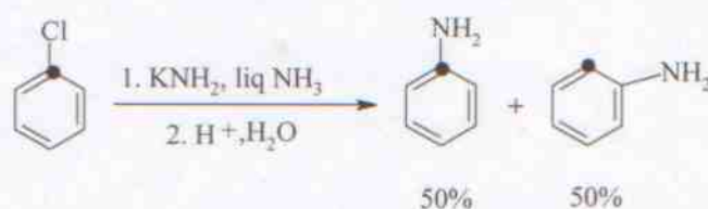
Benzenamine -1- 14 C Benzenamine -2- 14 C

Explain the formation of above two products.