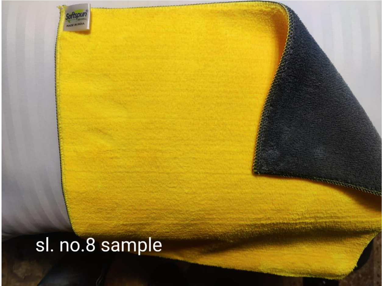
sl. no.8 sample