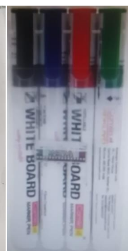
CAMLIN KOKUYO PB WHITE BOARD MARKER