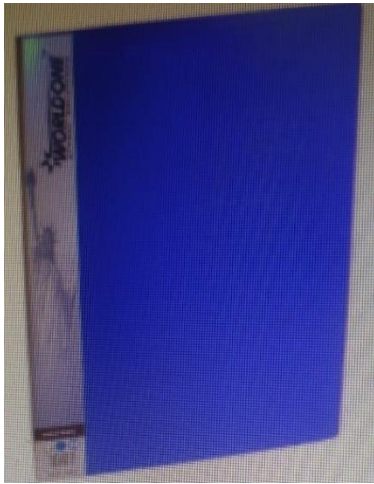
WORLDONE DISPLAY BOOK FILE