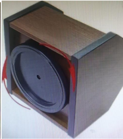
360 DEGREE ROTATIONS WOODEN PEN STAND